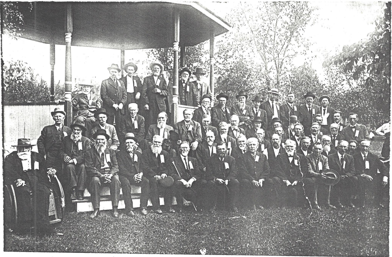
OLD SETTLERS PICNIC HANLONTOWN, IOWA 1913-1914