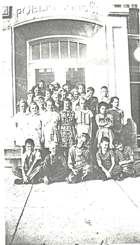
5 th grade