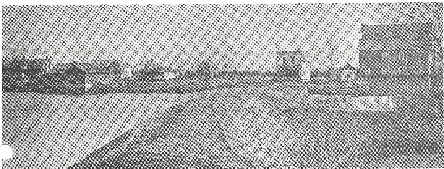
FRONTIER TOWN—Fertile was a frontier village when this photo was taken, in 1875. Willows had been cleared from the dike beside the dam (center to right), providing a view of William Rhodes flour mill, extreme right; the log cabin which