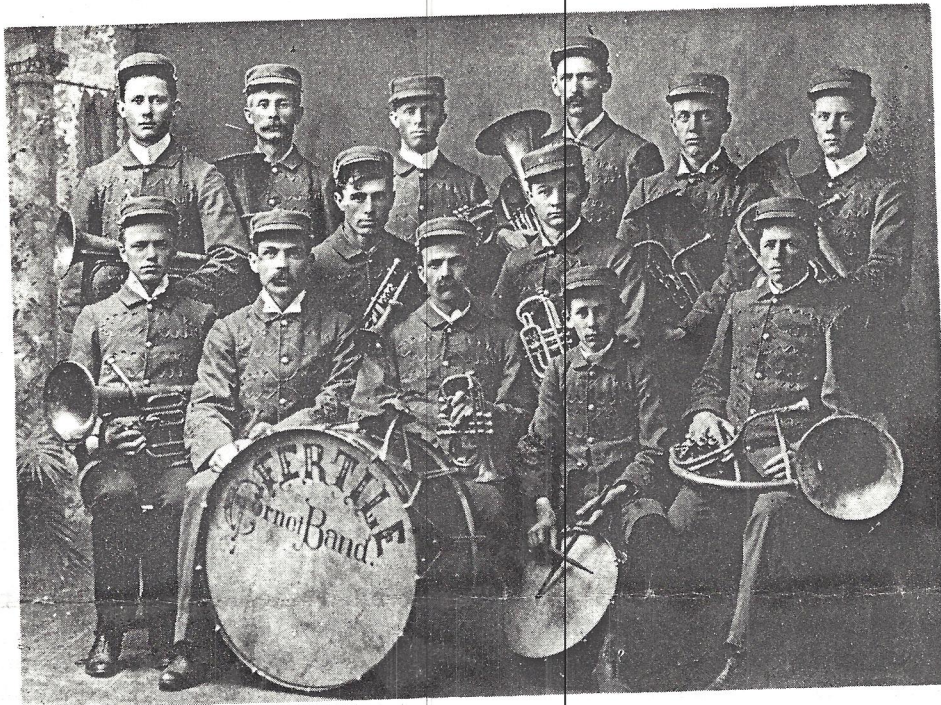
FERTILE'S FIRST BAND IN THE YEAR 1892